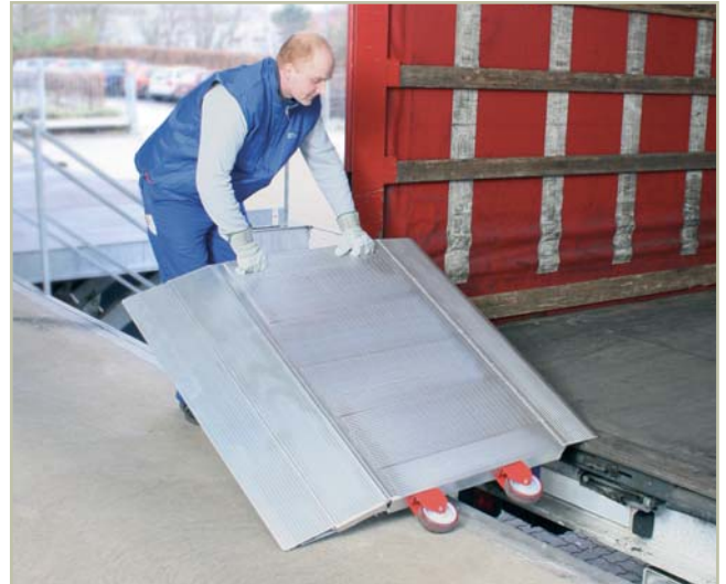
Loading aids & accessories page 10 ff