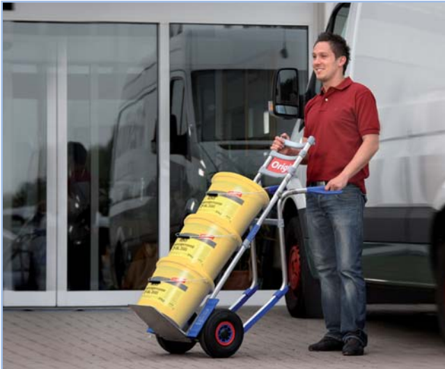
Manual transport equipment & accessories page 4 ff